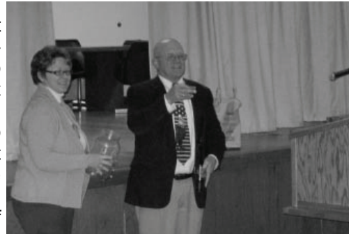
Rotary members served dinner at the annual Developmentally Disabled and their families on Wednesday night

of law enforcement and other government agencies to collect and interpret information relevant to criminal / terrorist activity in the Eastern Judicial District of California.