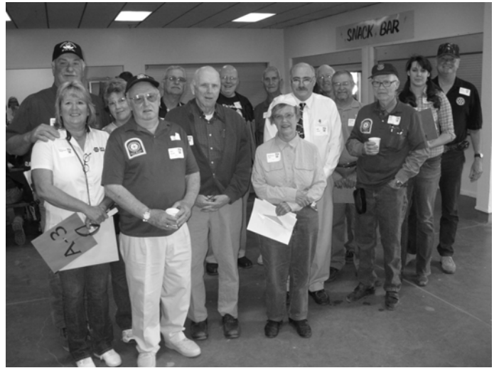
Education Day at the Fair 2008